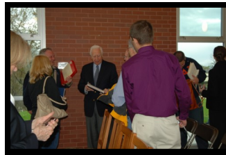
Author David McCullough signs books after his address at RMU. Honors students studied McCullough's work in preparation for his visit to campus.

"Becoming a member of the Honors Program was one of the best decisions I made when enrolling at Robert Morris University. The program truly set the course for my academic career and allowed me to learn and grow in an academic organization with students just like myself. The smaller class sizes allowed us to interact on a one-on-one basis with dedicated professors. In preparing the thesis, I realized an interest in advancing my career in research. I went on to pursue a master's degree in Library and Information Science from the University of Pittsburgh and am currently working as a Librarian at the Library of Congress."