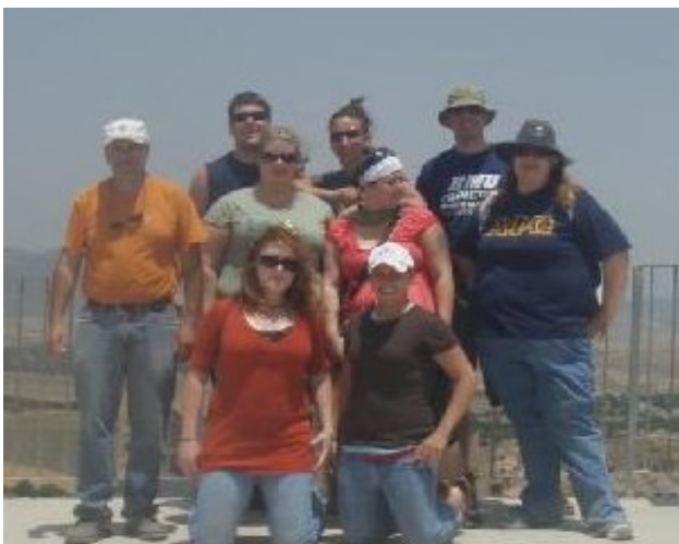
Israel, May 2009